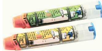
EpiPen® Autoinjector Junior and Adult

Airway, breathing and circulatory problems. Unconscious. Cardiac arrest.